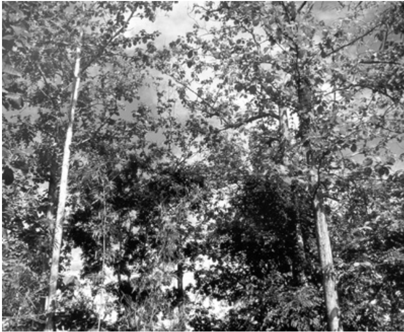
A natural teak stand managed under the Myanmar Selection System

variants of it, should continue to help avoid controversy. Nonetheless, at least one recent consumer crusade in the United States has campaigned against buying Myanmar teak.